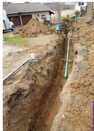
Open cut repair of lateral