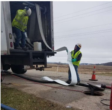
Getting liner ready for installation in the sewer main