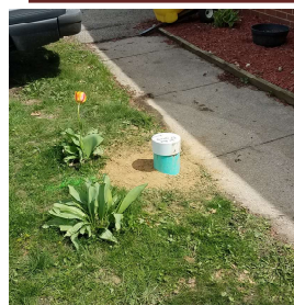
Very precise work!