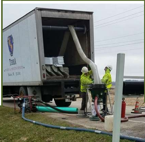
Installing the liner in the sewer main