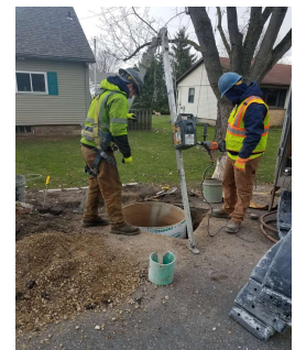
Prepping a manhole for rehabilitation work