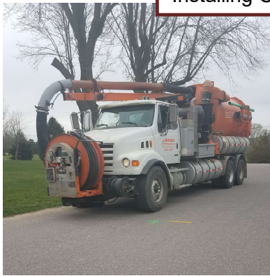
Vac Truck used to install cleanout