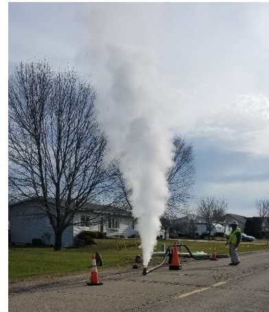
The final step – steam is used to cure the liner